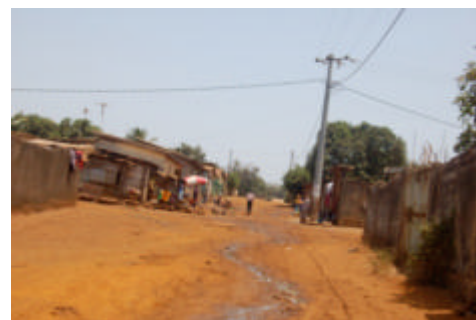
^ Our neighbourhood in Conakry, Guinea v Our new bathroom

for more pictures visit: http://tinyurl.com/guineahome