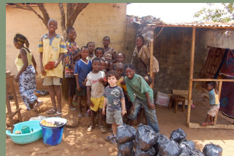
^ A little store on our street in Conakry