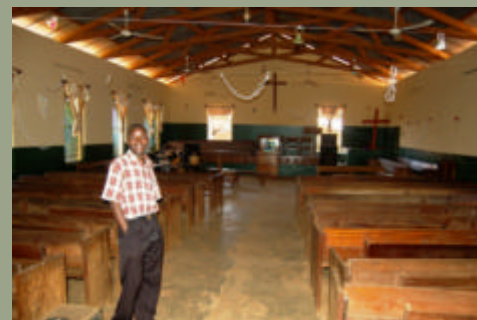
^ The church we will attend in Guinea

There are a few items from our needs list below